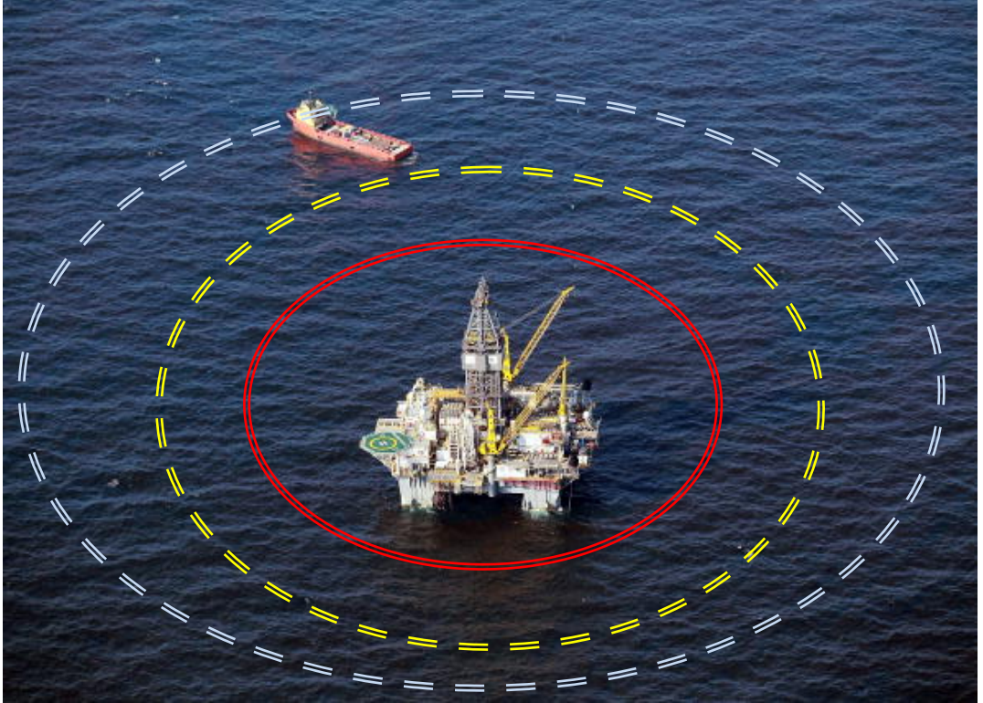
Figure 4: Security zoning for offshore oil and gas facilities

between 1 and 2.5 nautical miles, with approval to enter granted only by the facilities' operator. 17