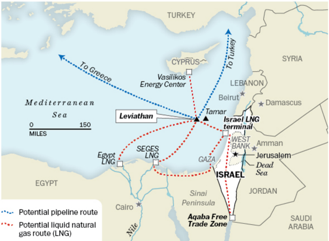
Figure 1: Israel's export options

will bolster the kingdom's economy and that Leviathan partners' export earnings will increase.